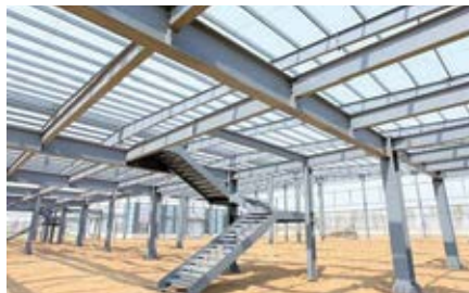
Structural Fabrication and Erection