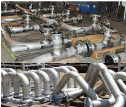
Pipe Spool Fabrication and Installation